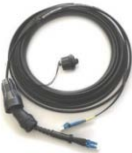
A type: Full AXS