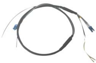
Armored breakout Type