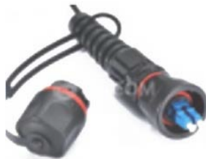
B type: ODVA