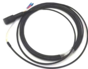
Waterproof Cover Type