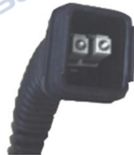
C type: NSN