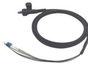
Waterproof Cover+Armored Type