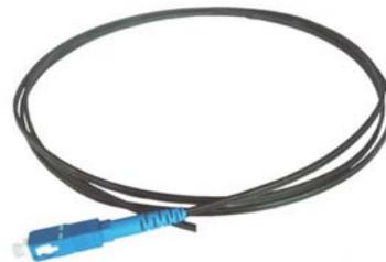
Drop Pigtail GJXH

Patch Cord assemblies are cord-type fiber optical cables terminated with connectors at both end. The type of cable fiber and connector and the length of the patch cords can be freely specified by the customer as shown below. Pigtails are used for terminating fiber optical cables by splicing them the fibers of the cable and connecting the other end, which supplied with a connector to a patch panel or directly to equipment.