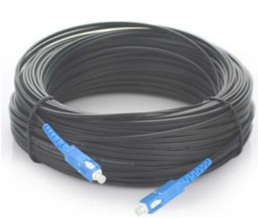
FTTH Drop Cord GJXH Simplex