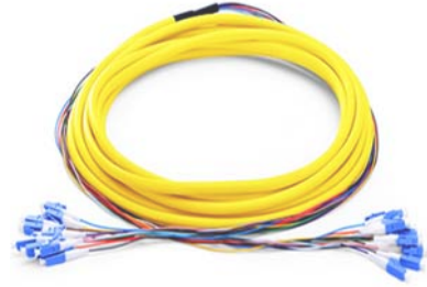
Bunched Patch Cord