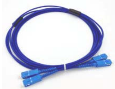
Patch Cord Armored Duplex